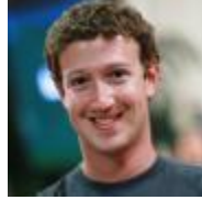
Mark Zuckerberg Founder, Facebook